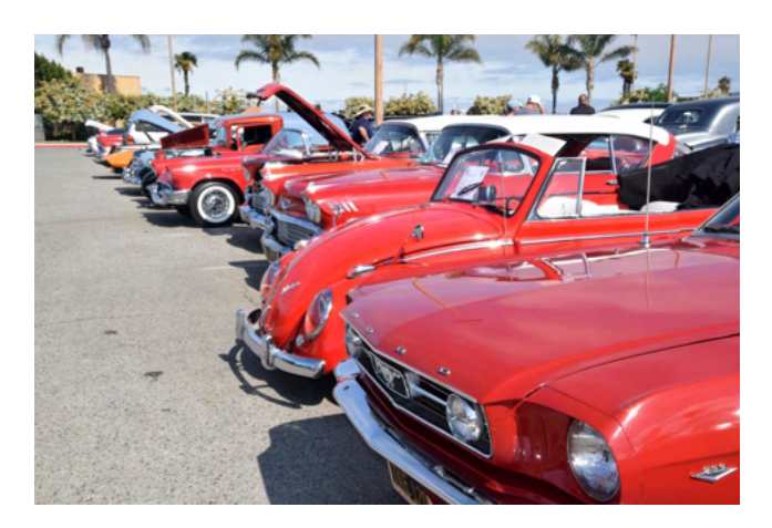
We had a "Pre War" section and the above is the "Red Car" section. Should we colour code all our rows next year? ( Editor, just joking! )